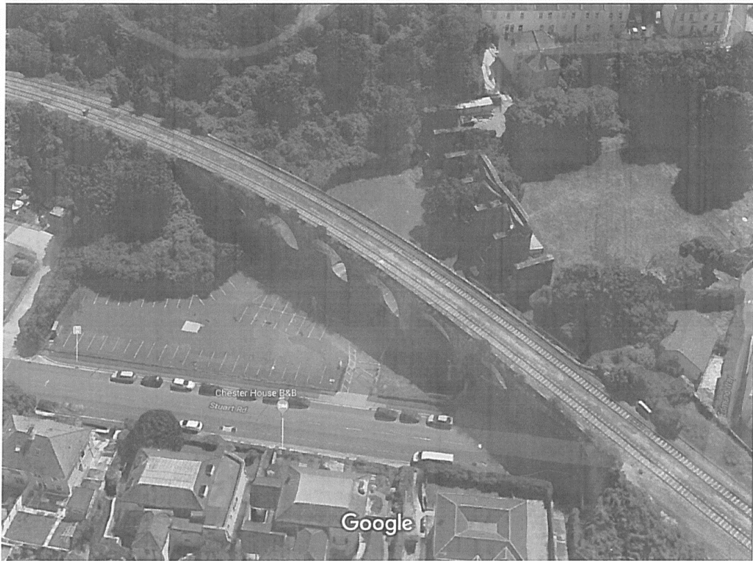
Imagery ©2018 Google, Map data ©2018 Google 10 m

https://www.google.co.uk/maps/place/Stuart+Road/@50.3780307,-4.1504831,128a,3... 15/06/2018