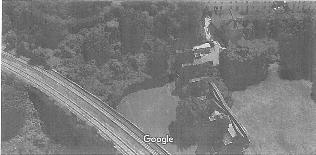
10 m

https://www.google.co.uk/maps/place/Stuart+Rd,+Plymouth+PL1+5LH/@50.377258... 15/06/2018